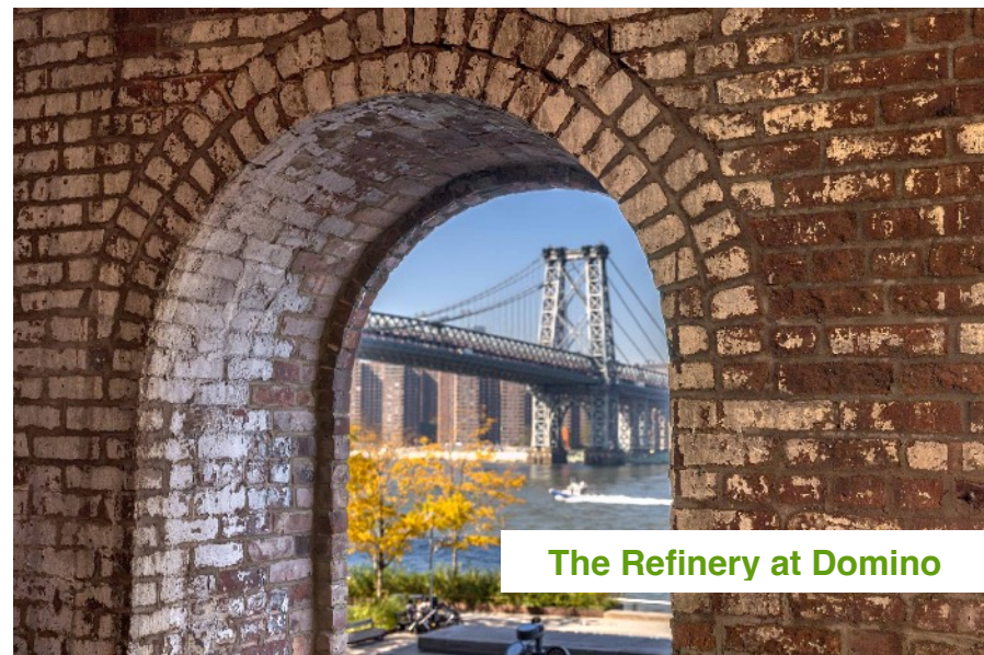
The Refinery at Domino